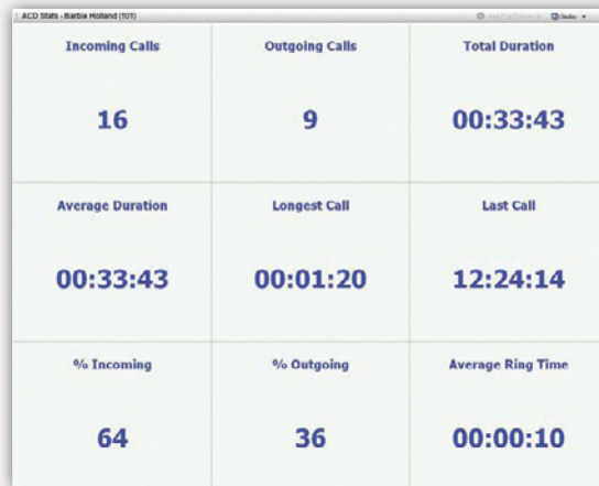
ACD Wallboard Tiles

In short, any company or organisation with a telephone system can benefit from using communications management software to monitor costs, productivity and efficiency. CommsOffice Pro™ is the ultimate communications management system, offering maturity, stability, ease of use and powerful market-leading technology to worldwide business.